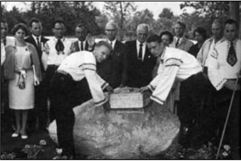
“Einweihung des Gedenksteines für Johannes Kelpius anlässlich des ersten Heimattreffens in Cleveland/Ohio 1963”